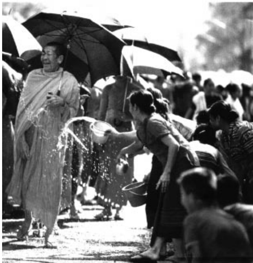
Throwing water on Buddhist monks in Laos.

The New Year celebrations of the Lao and Khmer are very similar—why? The Lao and the Khmer are two of only five national groups that follow the form of Buddhism known as Theravada Buddhism. The other three are Thailand, Burma, and Sri Lanka. This form of Buddhism incorporates indigenous beliefs such as ancestor worship and animism into the total view of life. The monks and their pagodas lay at the heart of social life, especially in villages.